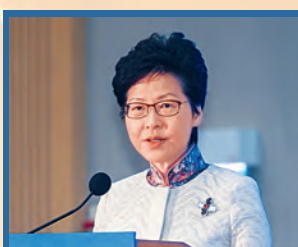
Mrs Carrie Lam Chief Executive of the Government of HKSAR

New Zealand, Germany, Greece, Ireland, Malta, Indonesia and Malaysia, as well as local academics, industry leaders and senior government officials delivered keynote speeches and shared news at discussion forums and parallel sessions. The Conference was well received and attended by over 400 representatives from around the world including consulates, government officials, QF and quality assurance experts, academics and professionals in education and training sector.